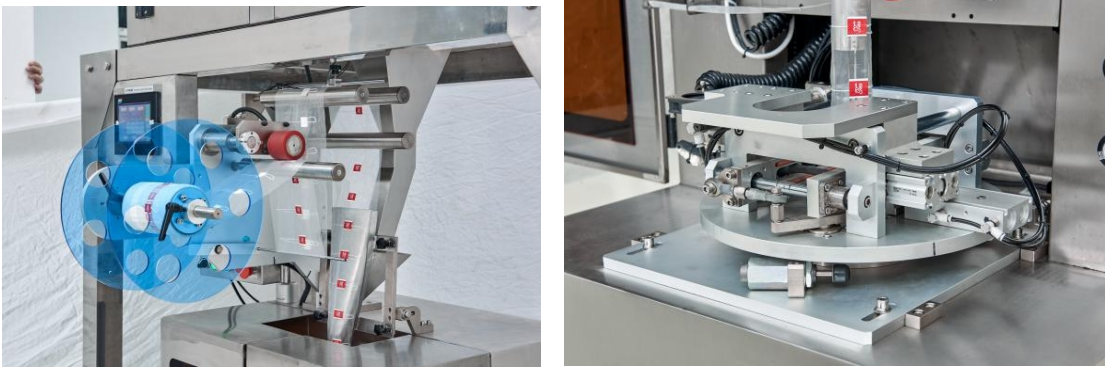
STB-50 Pyramid Tea Bag Packing Machine Details